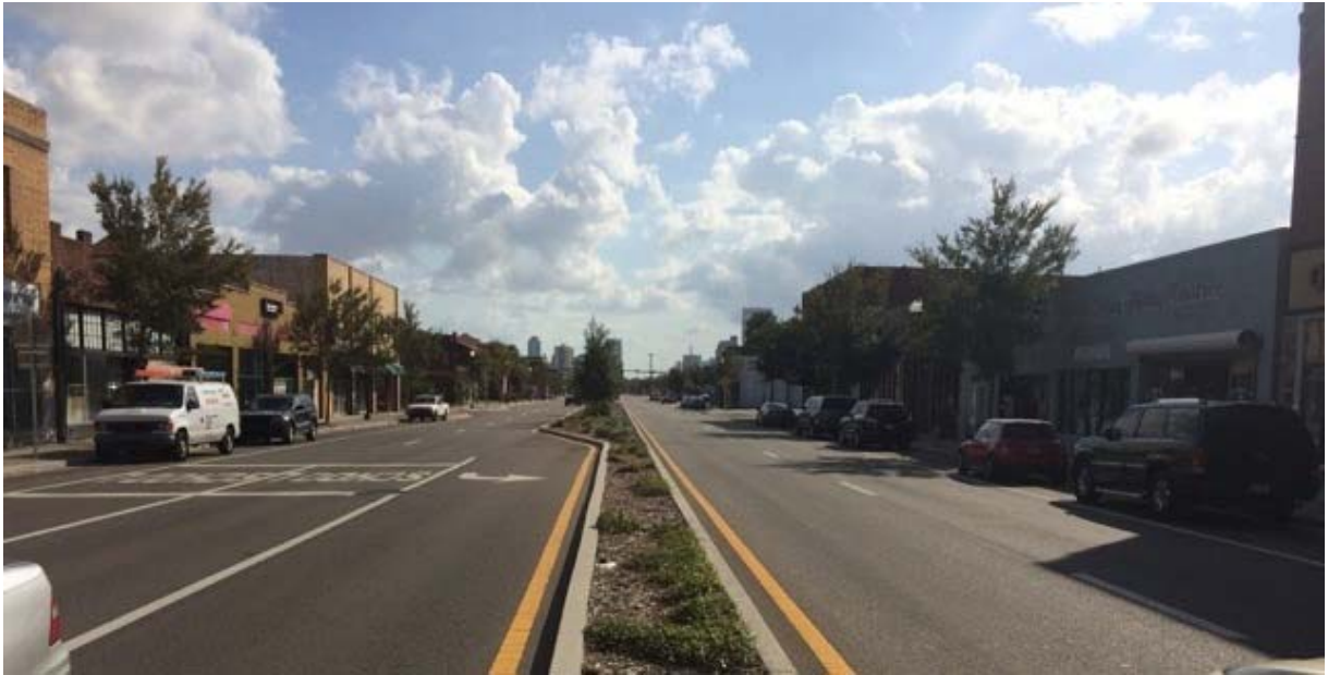
The subject site on the right facing south along Main St.