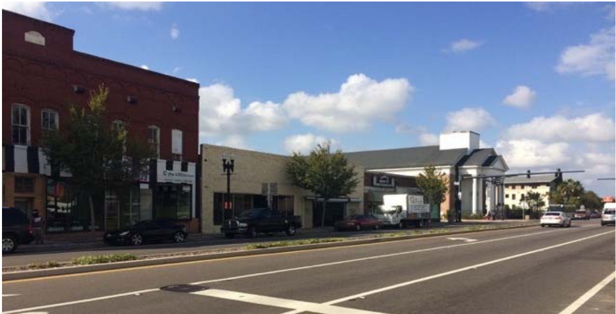
The subject site facing northwest from Main Street