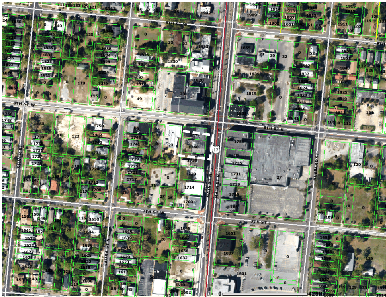
Aerial view of the subject site facing north