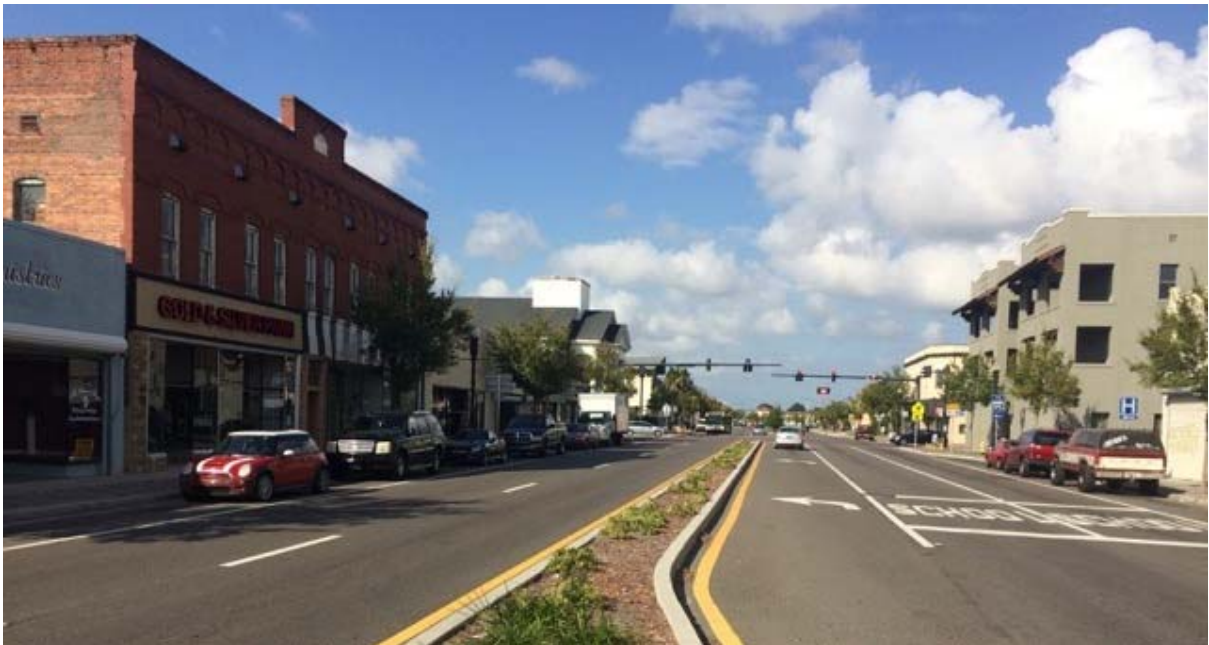
The subject site on the left facing north along Main Street